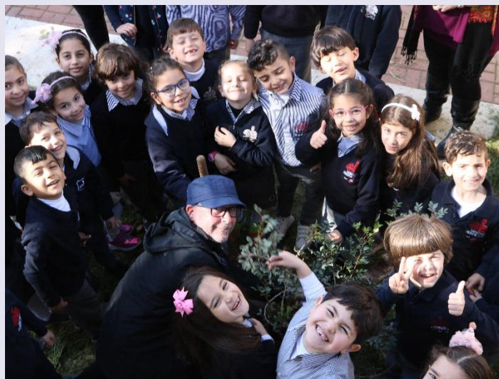
Head of School and first graders planting their tree in the Lower Campus as part of the 150 th anniversary Forestation Campaign.

Although we are individuals, it is when we act together that we can have the greatest affect. We come together in silent meeting to create unity and trust. We come together to plant and improve our environment.