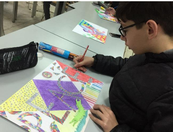
Upper School students embodied RFS’ Quaker Testimonies in their Art lessons.

Stewardship...What does it really mean to practice stewardship in an educational institution? Isn’t education a form of stewardship, be it academic or disciplinary? These are the kind of questions I contemplate regularly as I work with students and teachers on a daily basis. According to Quaker testimonies from the San Francisco Friends Council on Education, Stewardship is caring for the earth and its inhabitants. In a school setting this means that we care for students’ well beings, and the environments they live in, but we also teach them to care for themselves, their peers and the school environment. At the Upper School stewardship shows up in the most direct way, like the school environmental club hanging signs urging students to turn off the lights, and to wash their hands after using the bathroom and to throw paper towels in the trash. Or the planting of trees as we did in March 2019. Or putting up trash cans with lids so that littering is curbed. Other times stewardship shows up in the library as